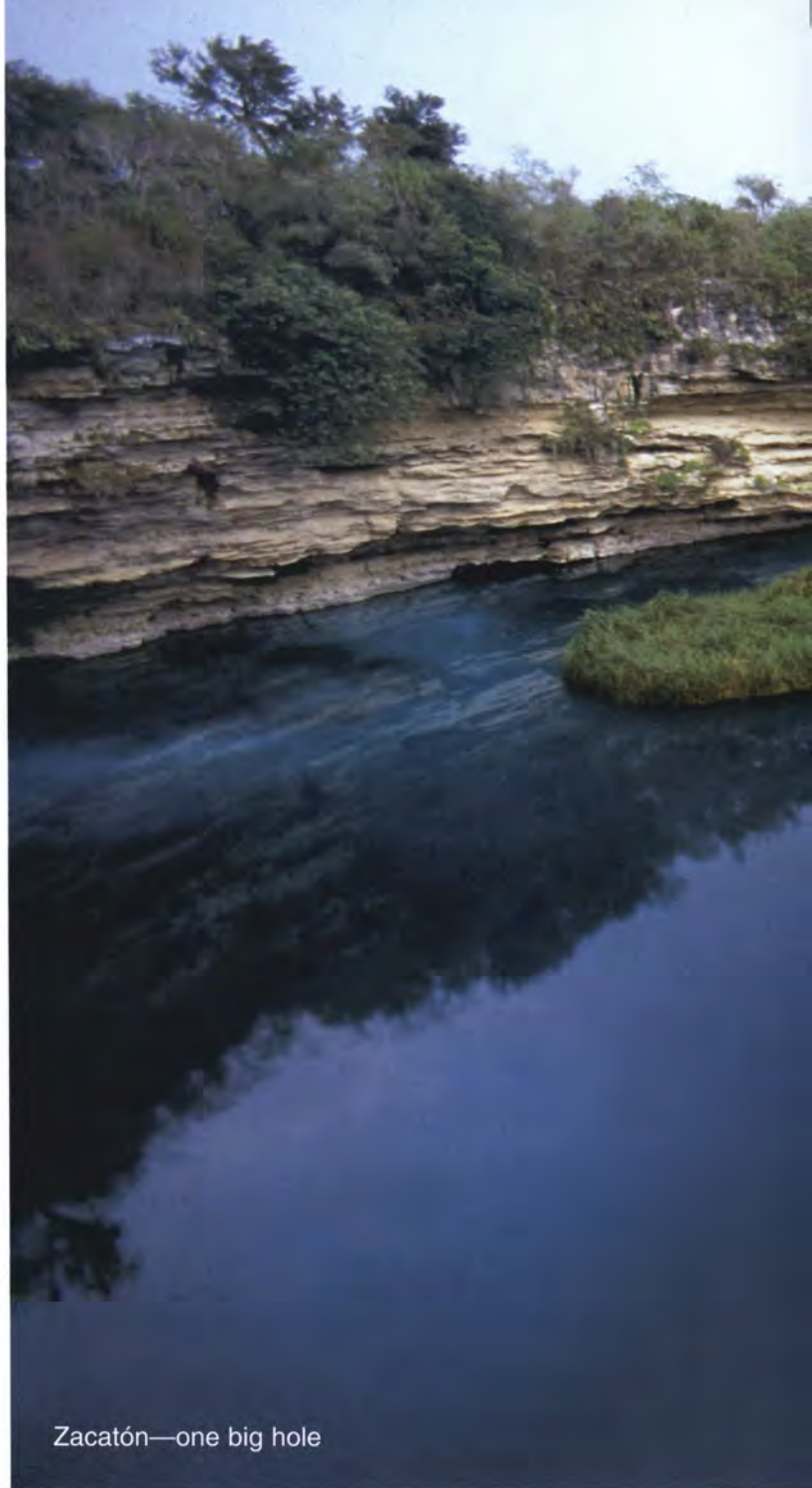
Zacatón—one big hole